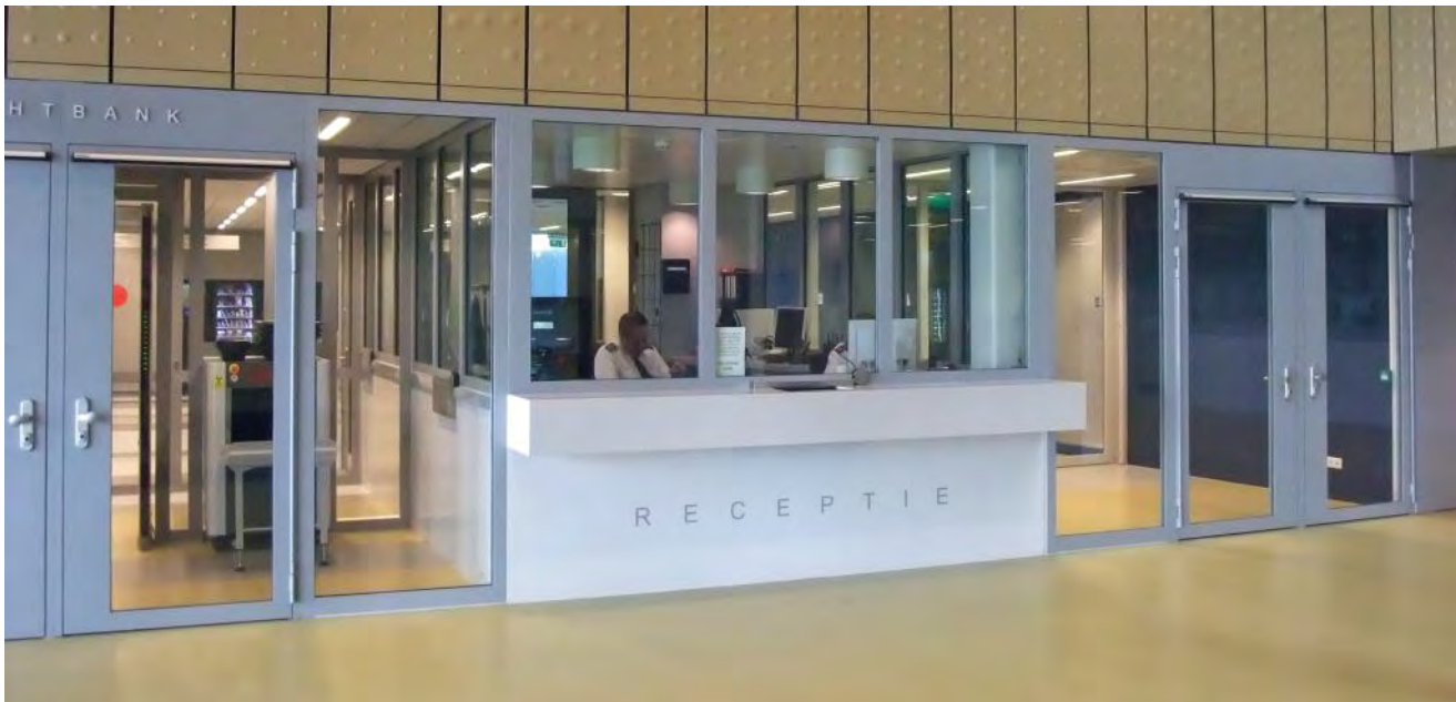
Entrance to a secure zone at the airport: guard room with several transaction windows, partitions and doors. 2 separate entrance doors each designed as an interlocking door system for identity check.