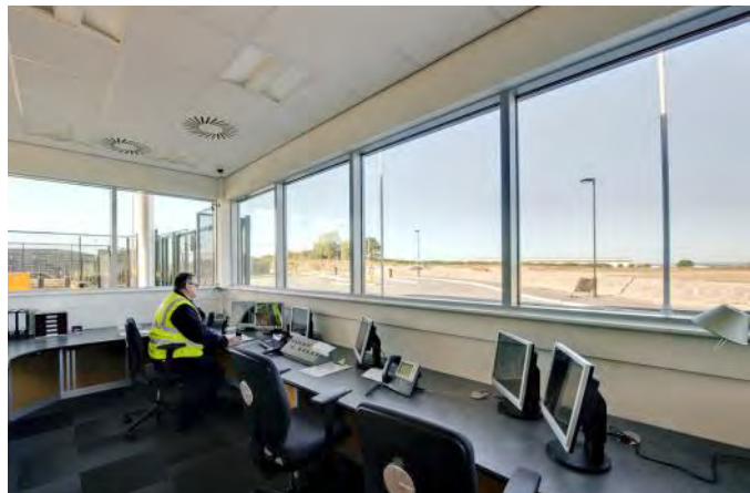
Interior of a guard room of a data center.