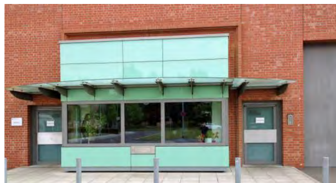
Security entrance to a prison. Guard room and 2 separate entrance doors for visitors and staff as well as a gate.

All products can be manufactured in the same protection level against forced entry, ballistic and blast attacks