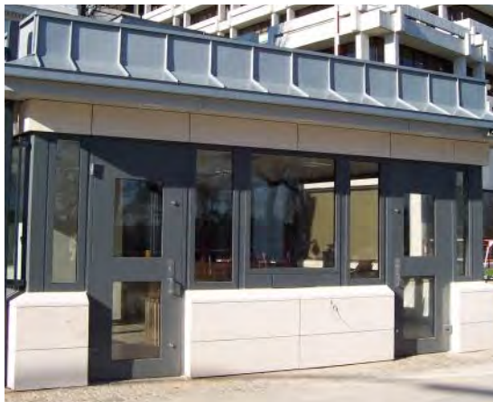
Guardhouse for the access control to a consulate of a foreign nation in Germany.