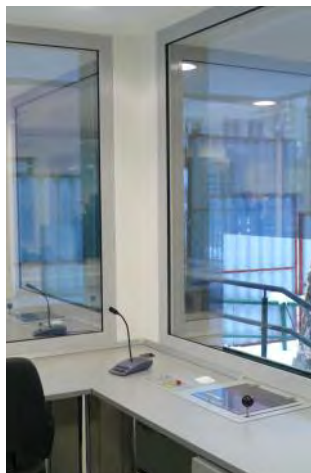
Example: gooseneck microphone as a table-top version.