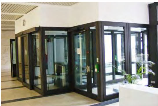
Entrance of a court: interlocking sliding door system, separate entrance / exit doors and escape route door.