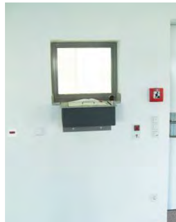
Transaction window and exchange drawer, combined protection against bullets and fire (special construction).

You will find the information about security levels, test results and design variations of steel doors, gates, aluminium doors and partition walls in separate brochures.