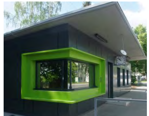
Individual designed security entrance of a military property.