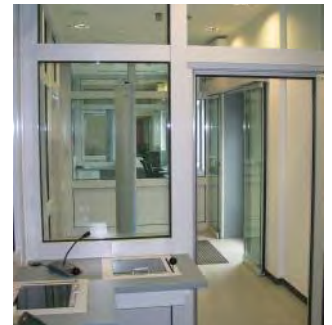
Guard room integrated into an interlocking door system.