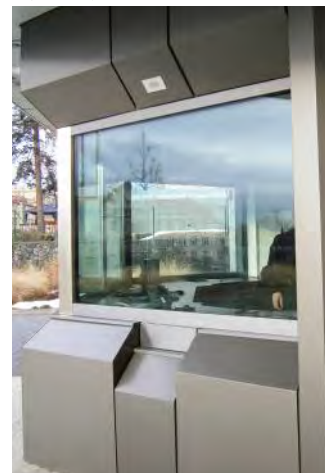
External speaker integrated in the ceiling and microphone integrated in the frame, aluminum cover is sandblasted.