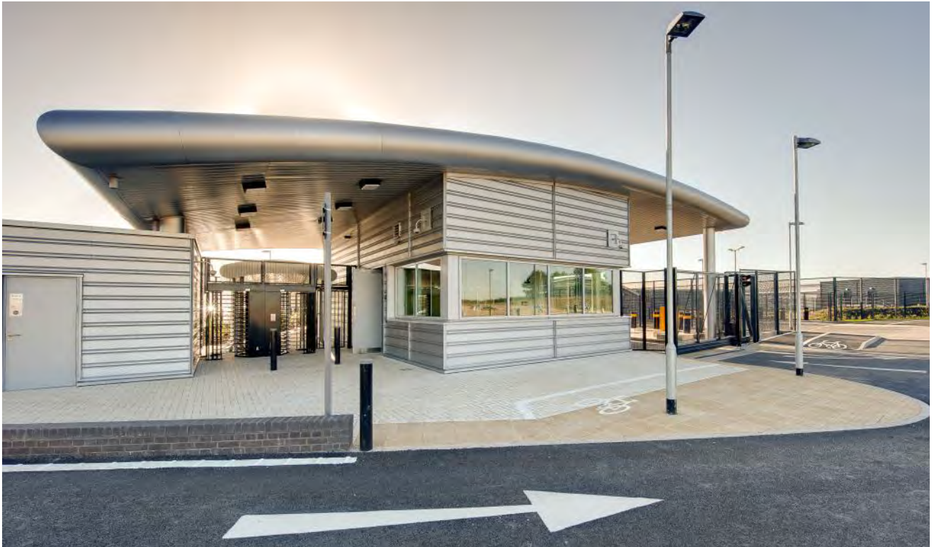
Security entrance to a data center.