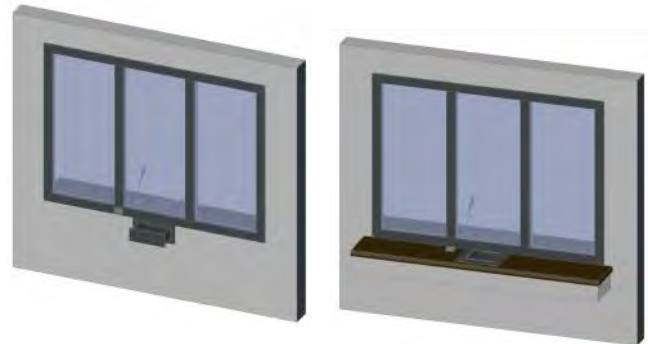
Multiple window elements.

Size, material, color and cladding of the window are customized. The installation depth differs depending on the selected profile system. The left transaction window is equipped with a flush mounted transaction drawer which moves in one direction. In the right window a transaction drawer is installed in a counter, the tray moves in opposite directions.