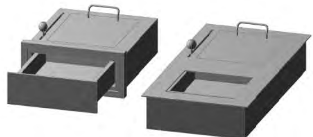
Exchange drawer for flush mounting into the wall. For indoor and outdoor use.

Bullet resistance up to FB7-NS. Fire protection on request. Individual colour design or cladding.